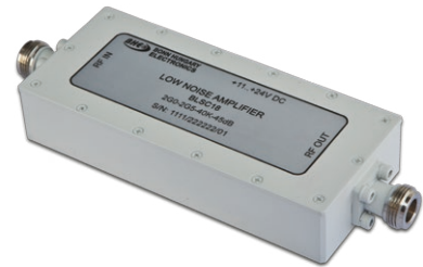
BLSC18 very low noise (40K) S-band LNA