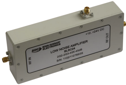
BLSC24 very low noise (40K) S-band LNA