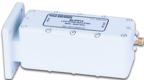
BLXW14 waveguide input (WG112) X-band LNA