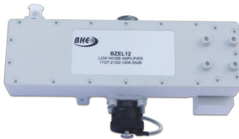
BZEL12 very low noise (120K) Ka-band LNA