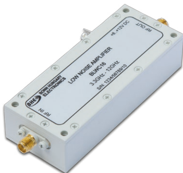
BLWC16 wide band (3300 to 12000MHz) Low Noise Amplifier