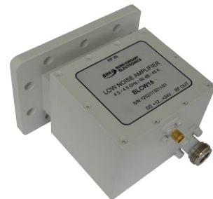
BLCW16 low operating temperature (-30 to +60°C) C-band LNA